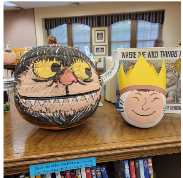
Pumpkin decorating contest

We held 36 story hours for young children. For the first time since the pandemic shutdown, we resumed offering story hours for toddlers and preschoolers in September. We did not hold any afterschool story hours in 2021, but did resume these classes in January 2022. We had 269 in attendance at the story hours for young children.