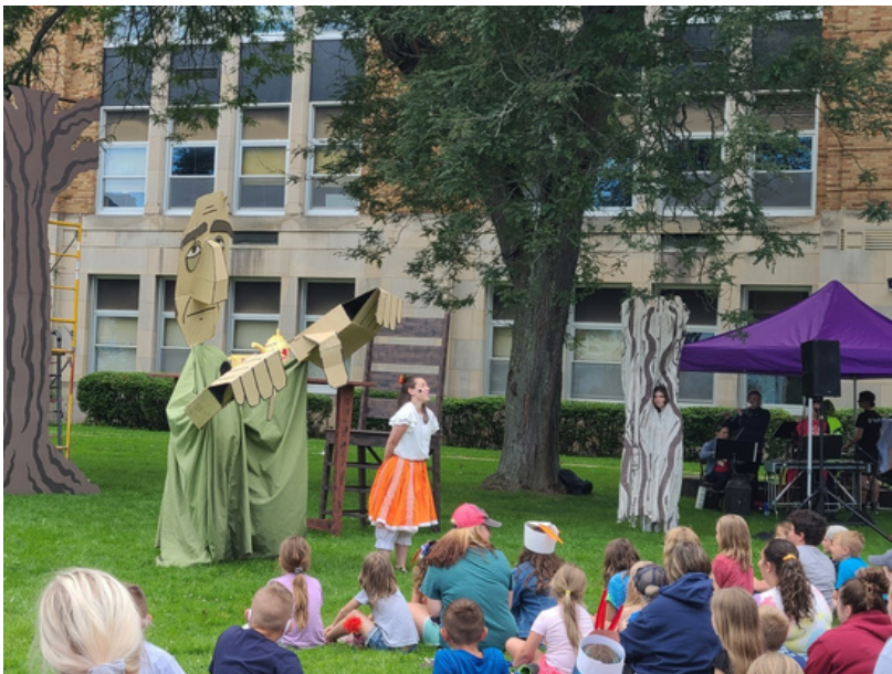
Artsapalooza, presented by Springville Center for the Arts.

Cuba Library hosted 490 programs in 2021, including a One Community book discussion, puppet shows, a variety of arts & crafts, pumpkin decorating contest, petting zoo, and educational programs for all ages. We partnered with several outside organizations for these programs, including Springville Center for the Arts, Palmer Opera House, Cuba Cultural Center, Grow It Forward, and Genesee Country Museum. Over 5,496 people of all ages enjoyed programs sponsored by Friends of the Cuba Library, Inc, NYS Council on the Arts, Allegany County United Way, Palmer Opera House, and the Kaleigh Wilday Foundation.